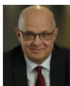
Berndt Körner Frontex