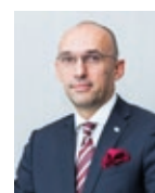
Krum Garkov eu-LISA