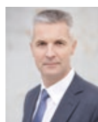
Artis Pabriks Rapporteur, European Border and Coast Guard Regulation