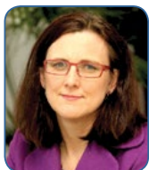
Cecilia Malmström European Commissioner for Home Affairs, European Commission