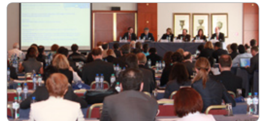
A total of 223 delegates participated to the 2012 edition of the conference

Contact - Anne-Lise Simon T. +44 (0) 29 20 783 023 anne-lise.simon@forum-europe.com