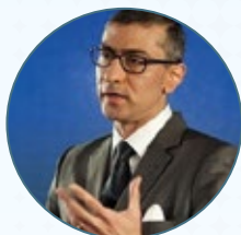
Rajeev Suri CEO Nokia