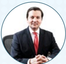
David Luna Sánchez ICT Minister Government of Colombia