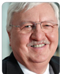
Jurgen Creutzmann , MEP, Committee on the Internal Market & Consumer Protection; Rapporteur for the Green Paper on Online Gambling, European Parliament