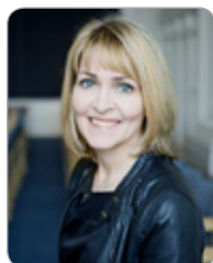
Christel Schaldemose , MEP, Committee on the Internal Market and Consumer Protection; Shadow-rapporteur for the Green Paper on Online Gambling, European Parliament