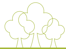
Exhibit at Raw Materials 2012

Stand Size: 2.5m x 3m / Cost: €1500 + VAT per stand