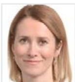
Kaja Kallas MEP, Rapporteur - Towards a Digital Single Market Act European Parliament