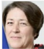
Violeta Bulc European Commissioner for Transport European Commission