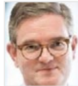
Sir Julian King Commissioner for the Security Union European Commission