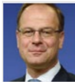
Tibor Navracsics European Commissioner for Education, Culture, Youth and Sport European Commission