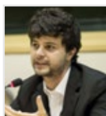
Brando Benifei MEP, Member of the Committee on Employment and Social Affairs European Parliament