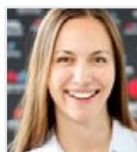
Eva Maydell MEP, Member of the Committee on the Internal Market and Consumer Protection European Parliament