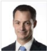
Alexander De Croo Deputy Prime Minister and Minister of Development Cooperation, Digital Agenda, Telecom and Postal Services Government of Belgium